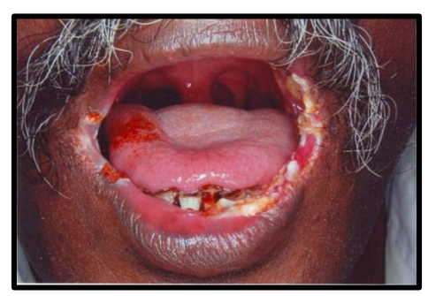
Fig. 1: Extra oral profile